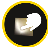
LUXURIOUS SOFT TOUCH FLEECE INNER