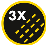
TRIPLE STITCHED SEAMS