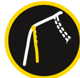
SET IN SLEEVE