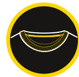
TAPED NECKLINE FOR COMFORT