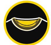
HALF MOON YOKE